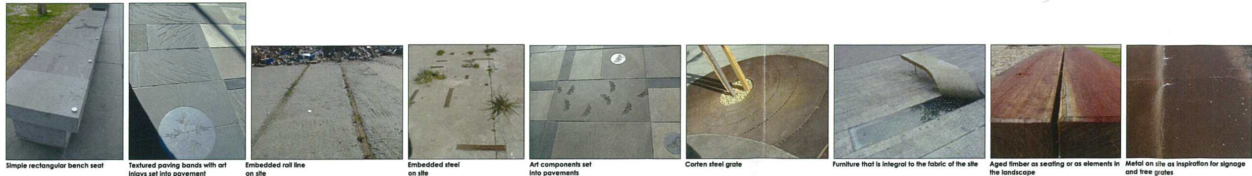
Simple rectangular bench seat Textured paving bands with art inlays set into pavement Embedded rail line on site Embedded steel on site Art components set into pavements Corten steel grate Furniture that is integral to the fabric of the site Aged timber as seating or as elements in the landscape Metal on site as inspiration for signage and tree grates

Individual courtyards include a choice of tree and plantings, but all feature gravel areas with large format pavers.